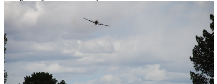
My old P-47 threading the trees on a strafing run.