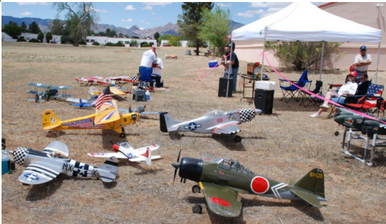
Just a few of the show planes on display.