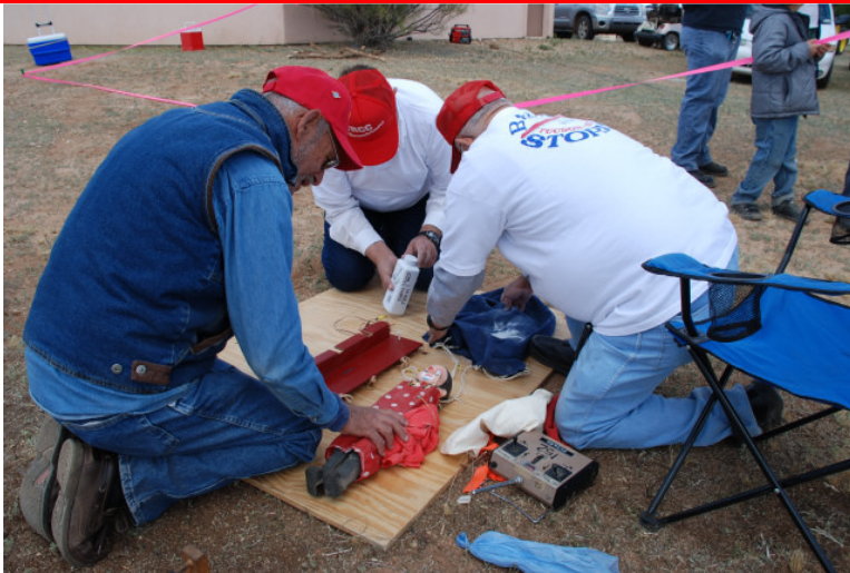
Just how many people does it take to load one very small parachutist on a model airplane?!?!? But a real crowd pleaser.